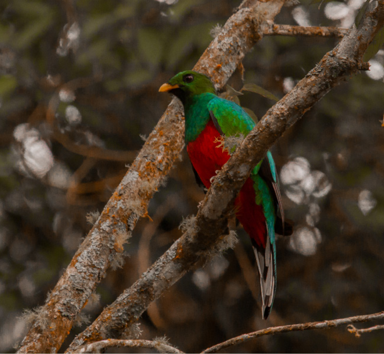
White-Tipped Quetzal