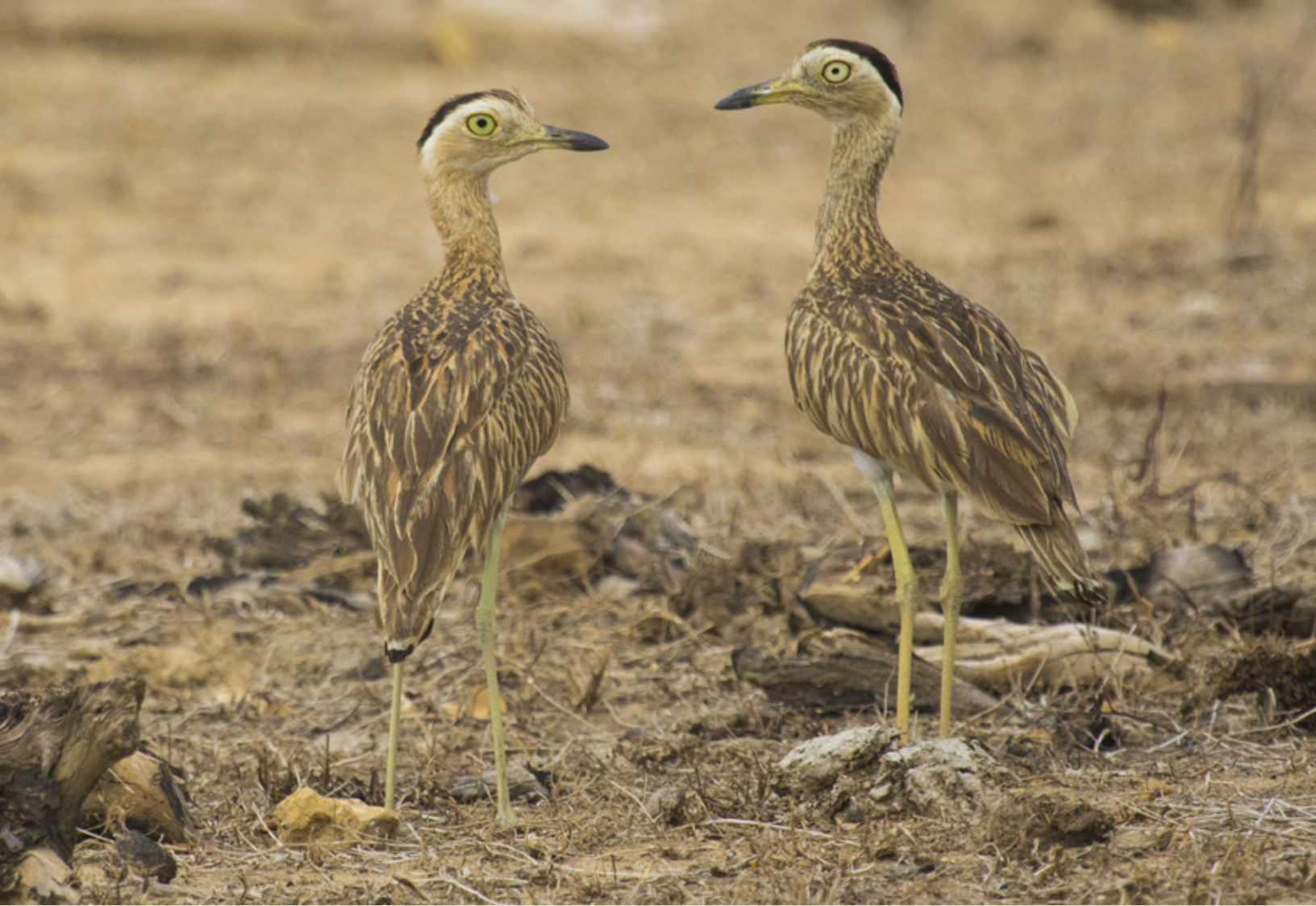
Double Striped Thick-knee Christopher Calonje