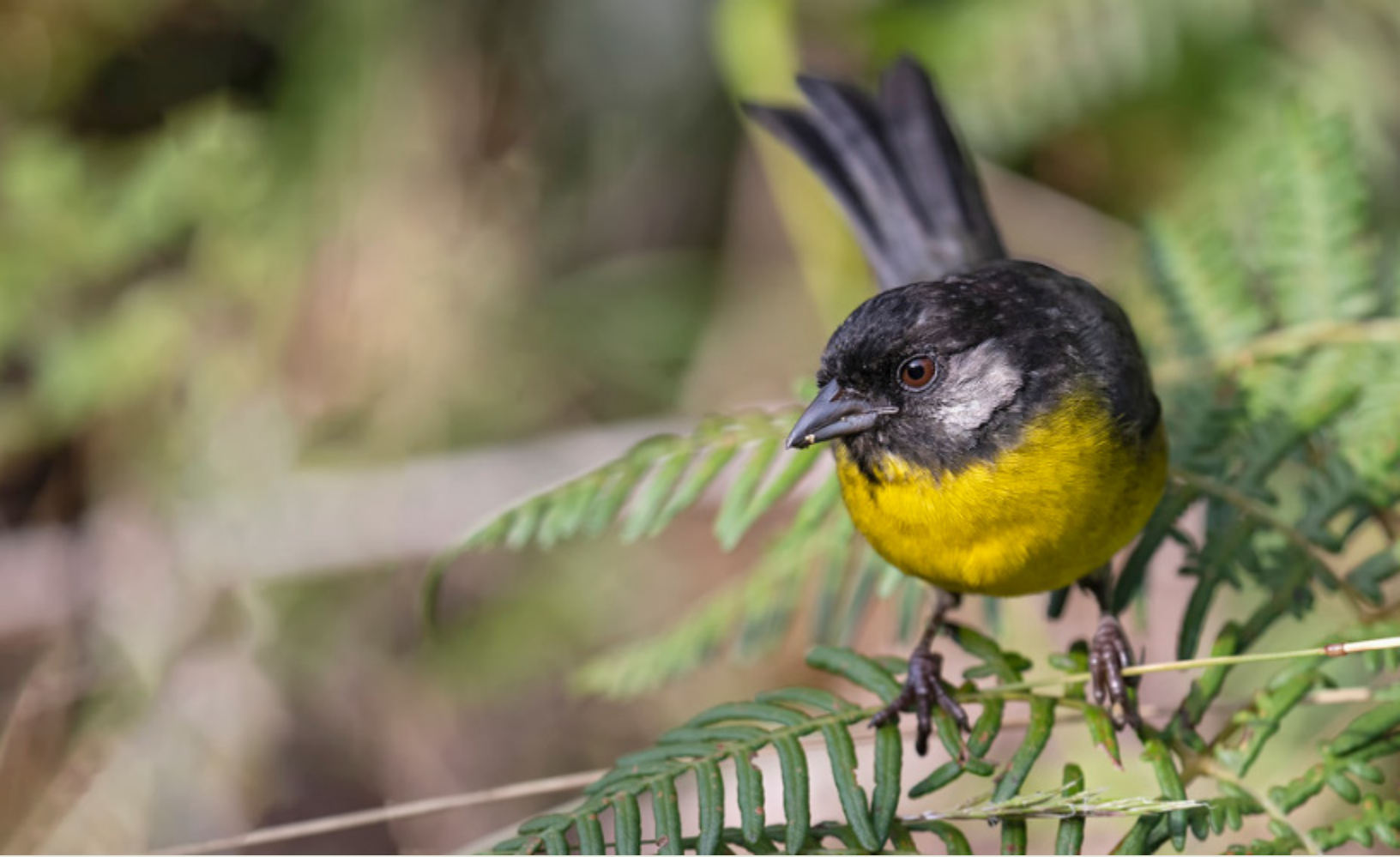
Santa Marta Brush-finch