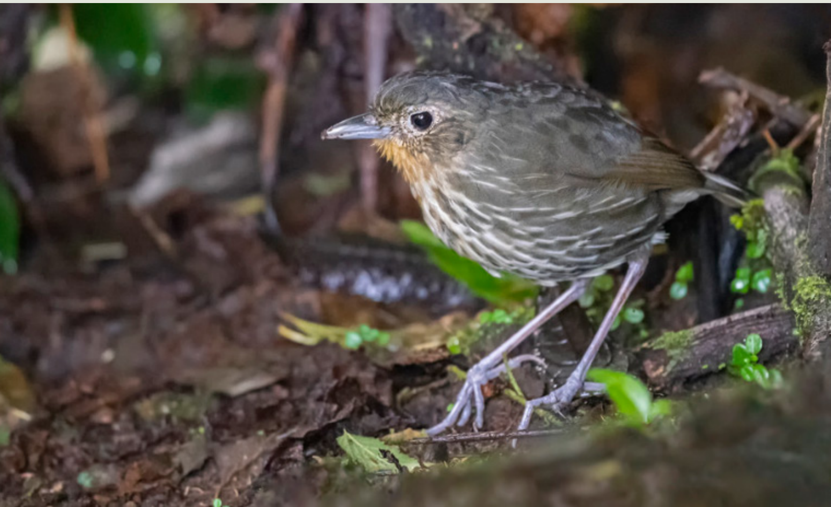
Santa Marta Antpitta