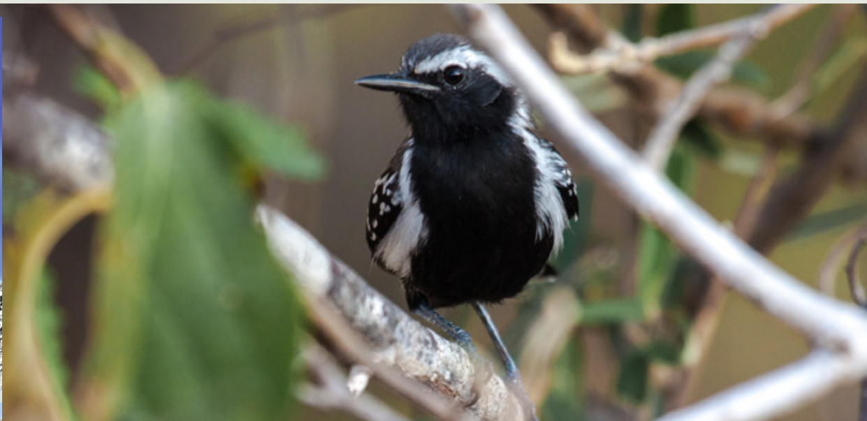
White-fringed Antwren