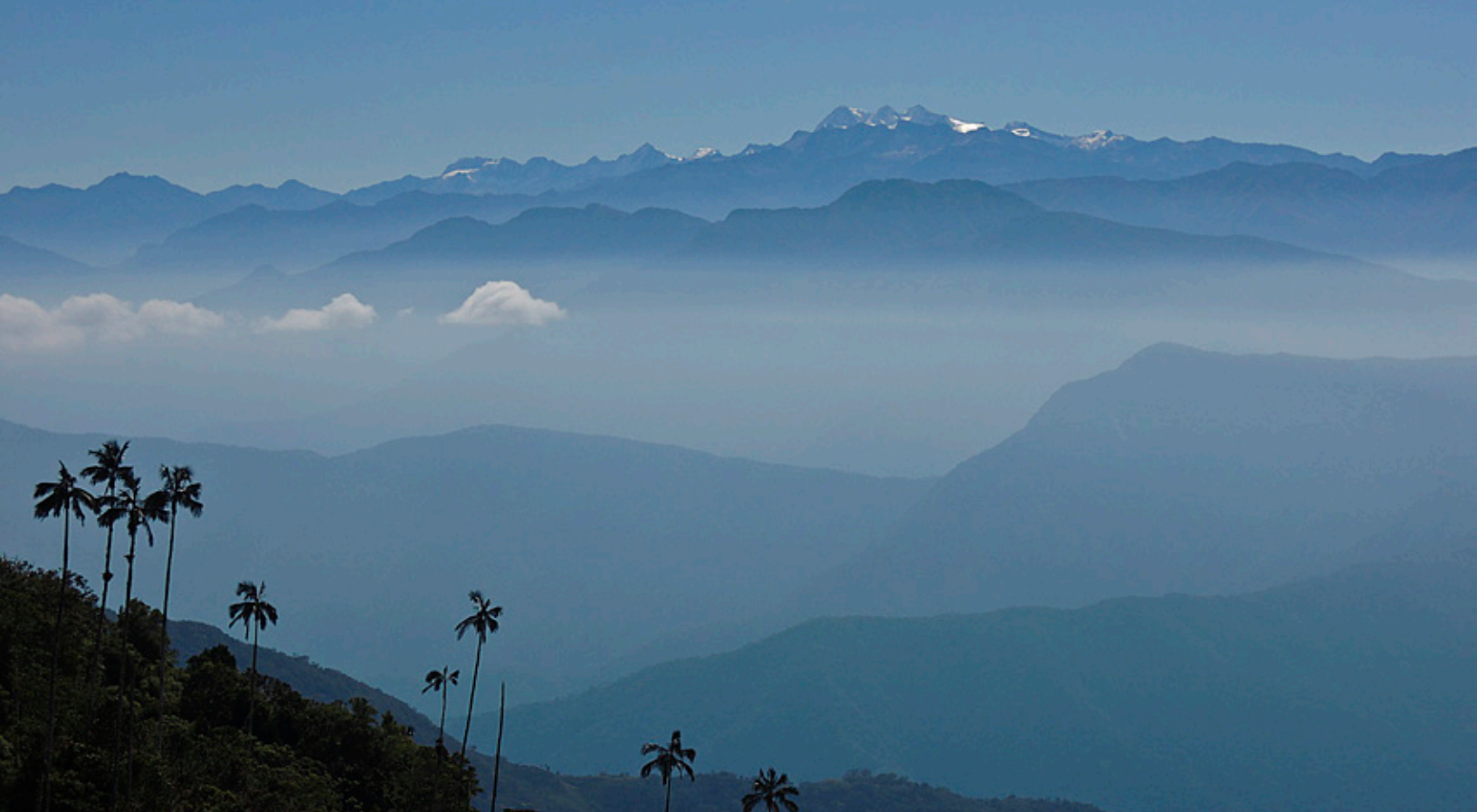
Sierra Nevada de Santa Marta Christopher Calonje

Colombia is the birdiest country on earth, with more than 1,950 species (almost 20% of the world's total). There are more species of birds in this country than on any other. It is easy to see why. Colombia is tropical, yet it also has ample elevation changes due to the Andes, furthermore it has both the Pacific and Caribbean coasts. The Andes become complex in Colombia, splitting into three ranges, which increases habitat diversity, as well as rain shadow valleys between the mountains. Colombia also comprises a vast portion of the amazon and the Orinoquia region. Lots of different habitats ensure an abundance of bird species.