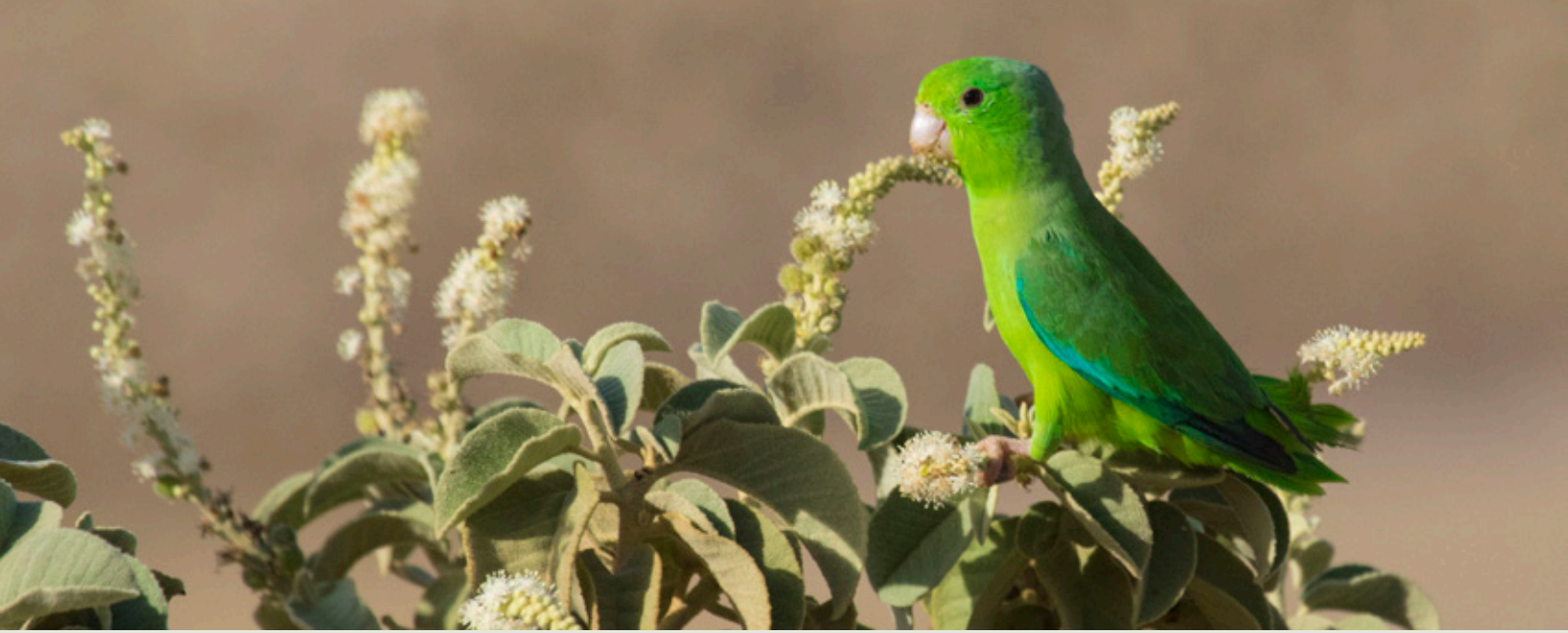
Green-rumped Parrotlet