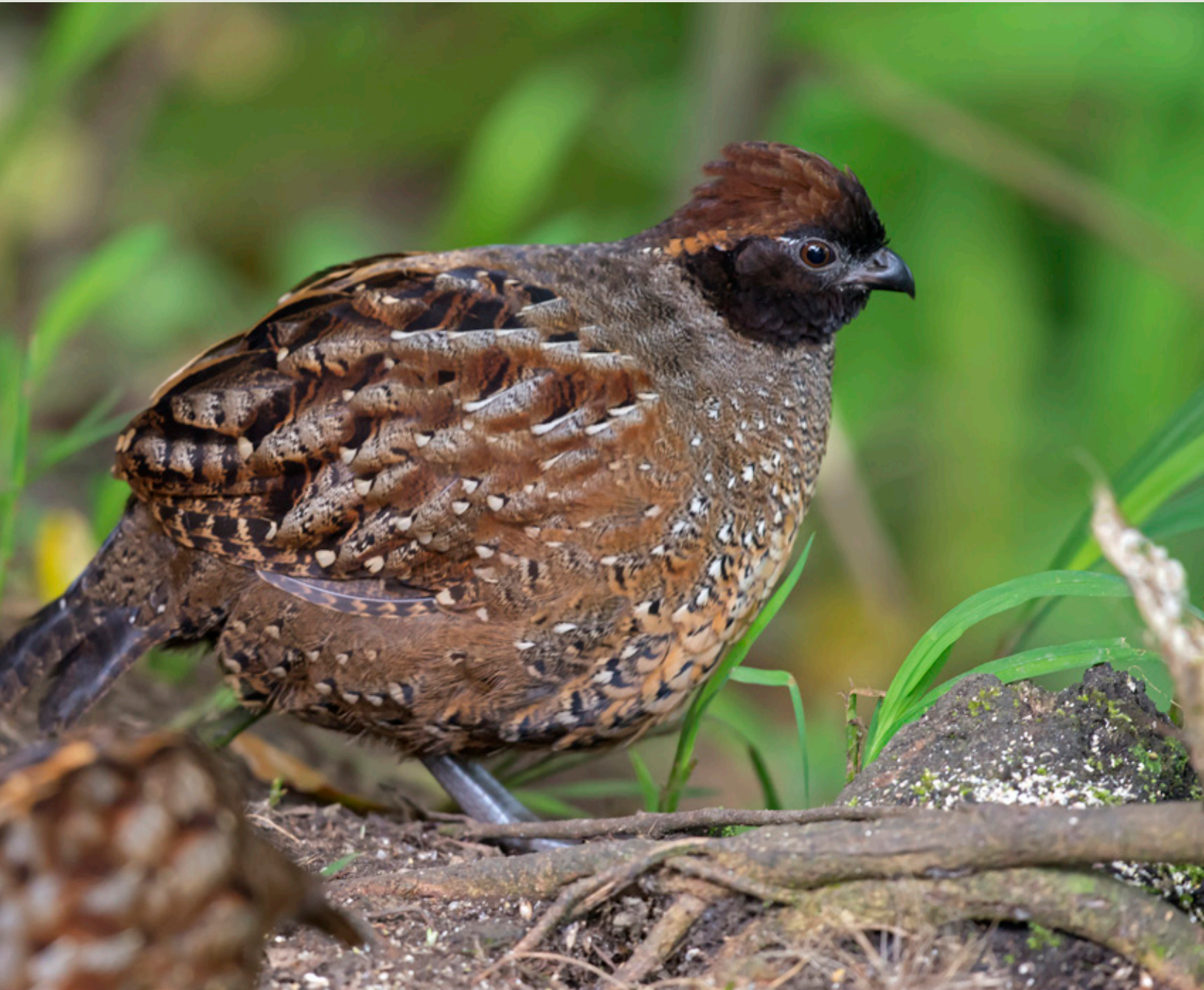
Black-fronted Wood-quail