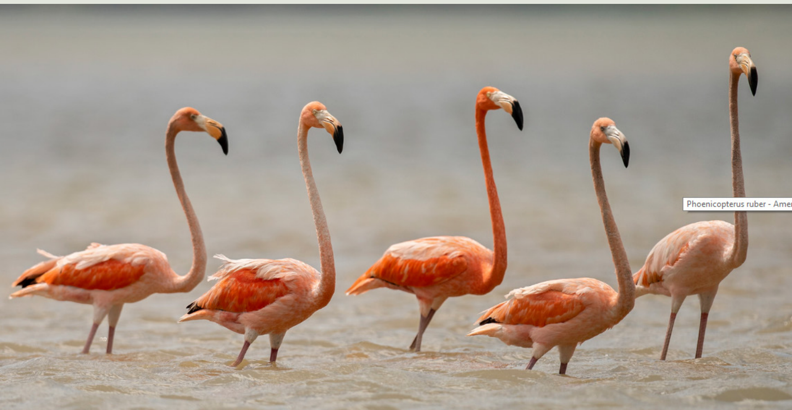
Phoenicopterus ruber - Amer