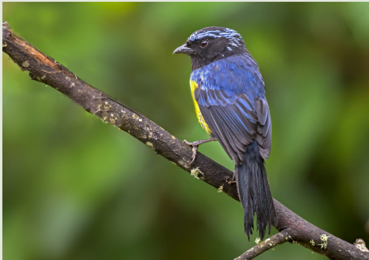
Buff-breasted Mountain-tanager