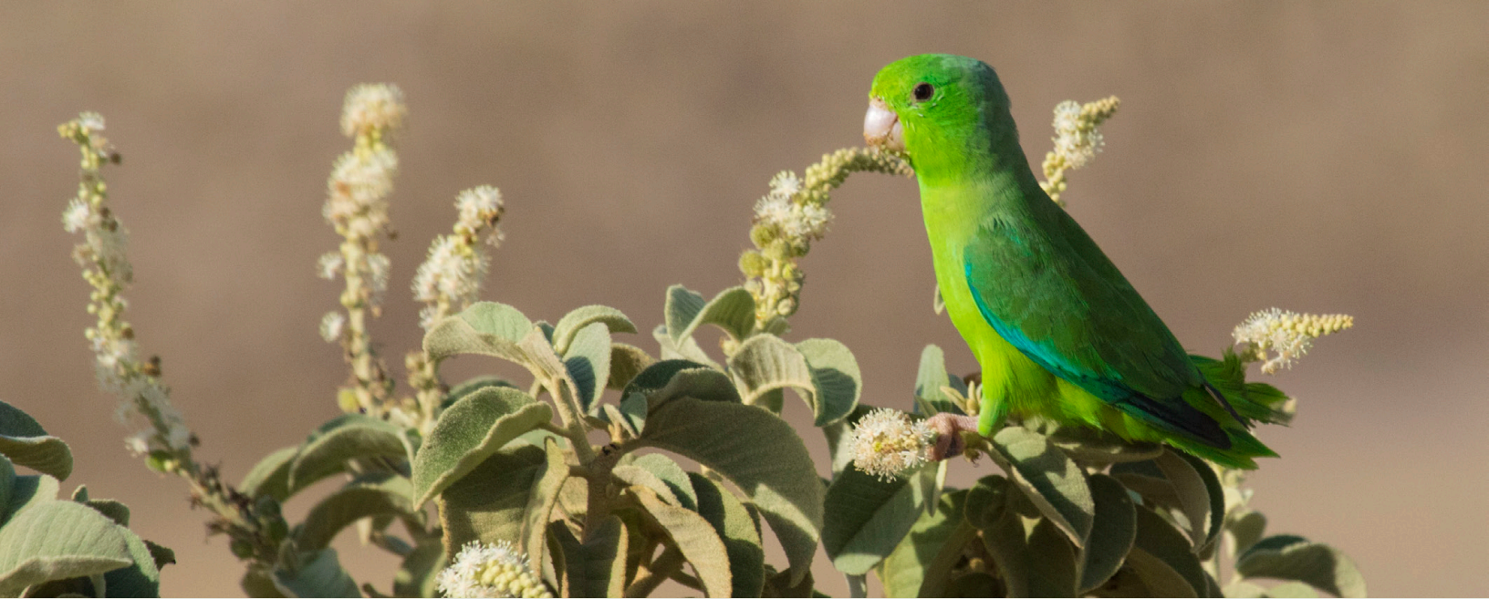
Green-rumped Parrotlet