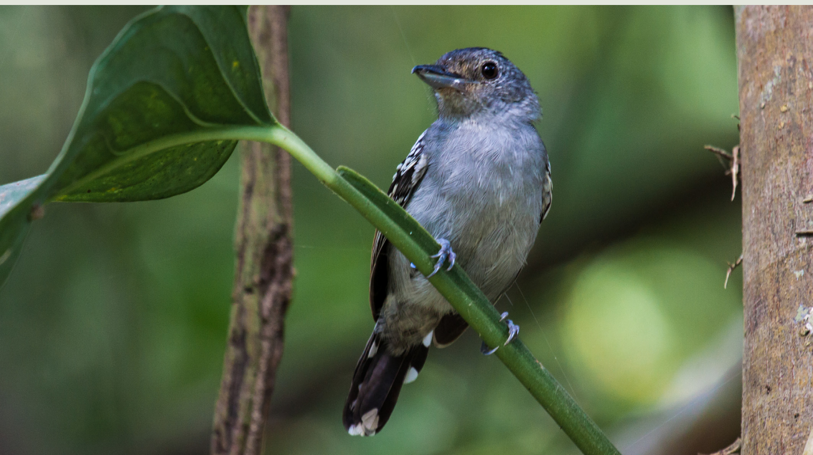
Black-crowned antshrike