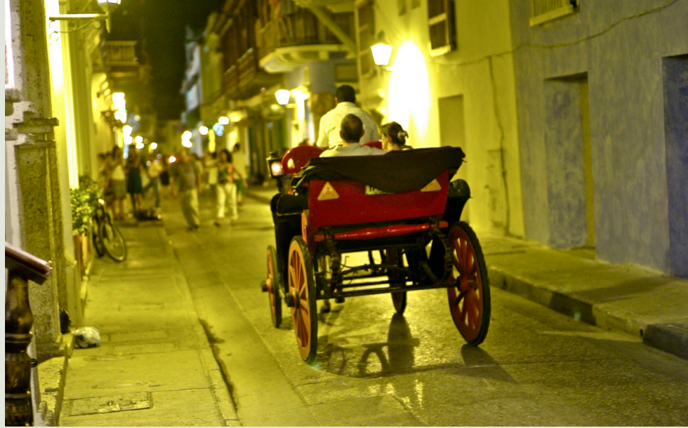
Islas del Rosario Procolombia