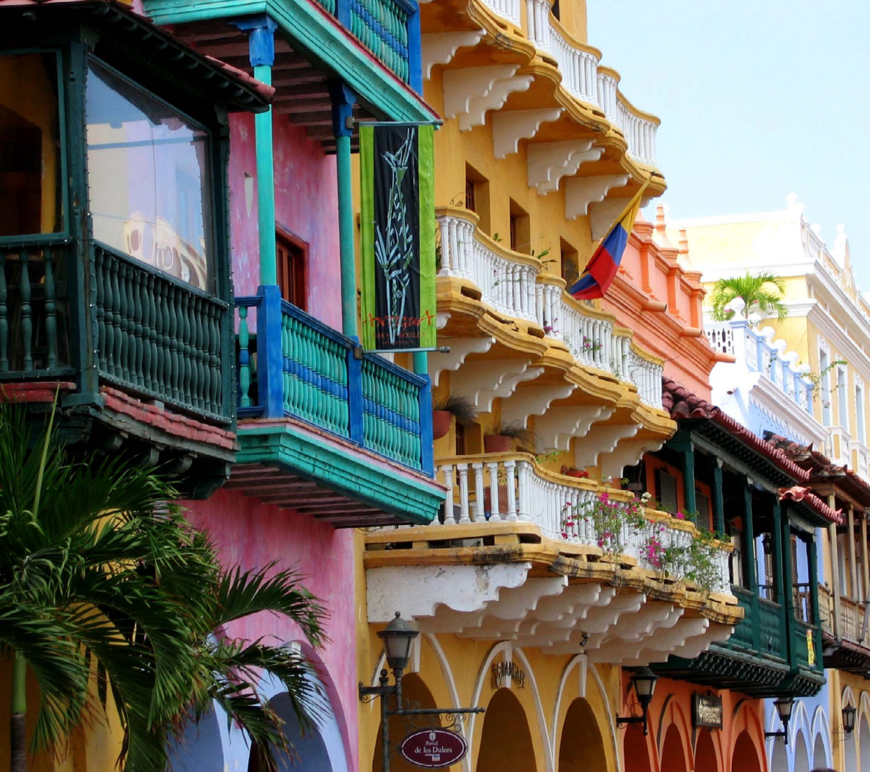
Streets of Cartagena Kike Calvo