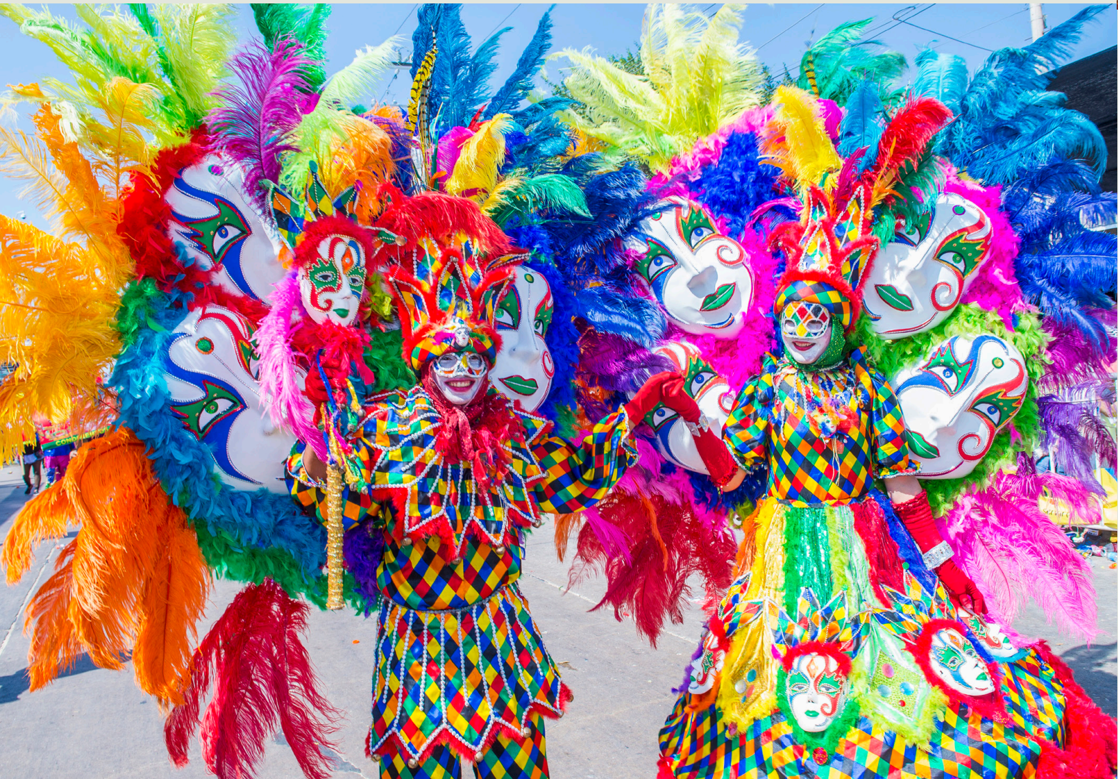
Carnaval de Barranquilla