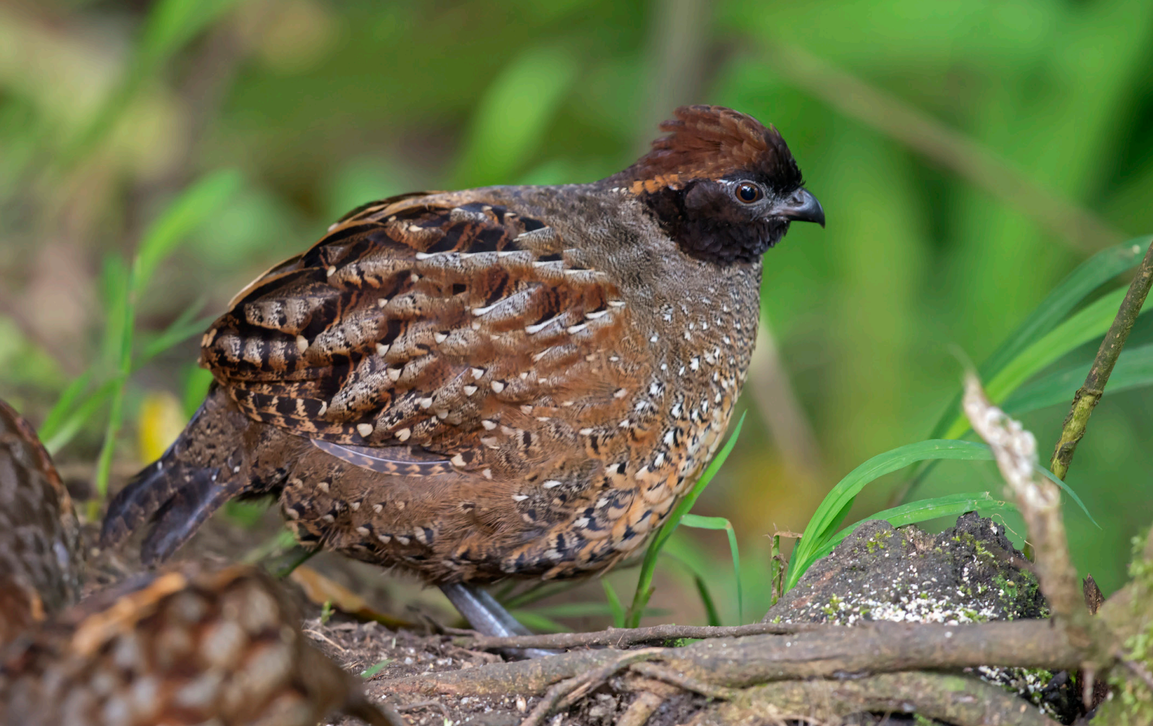
Black-fronted Wood-quail

lored Warbler, Golden-breasted Fruiteater and the near endemic White-tipped quetzal, one of the photographic targets of the trip!