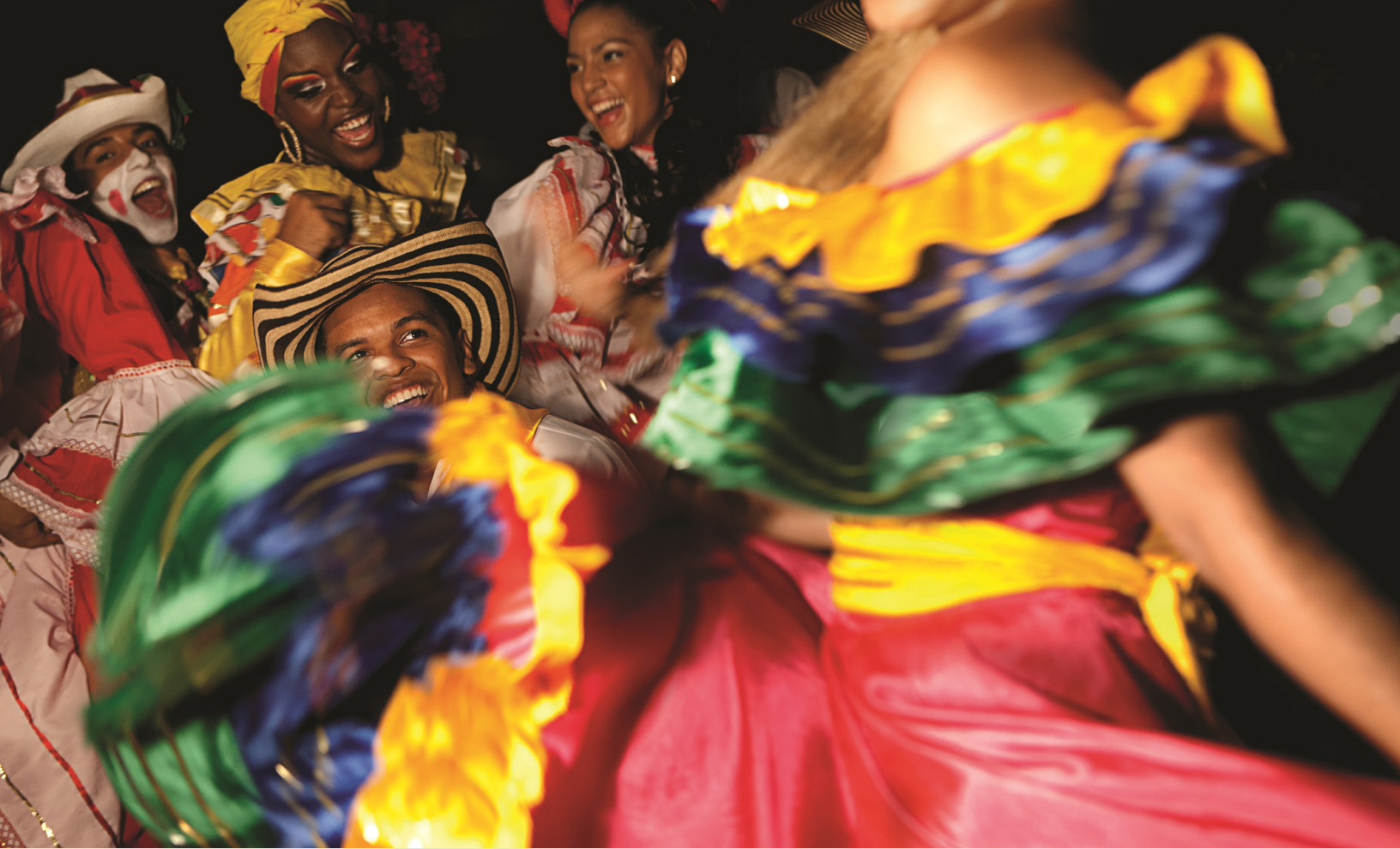
Carnaval de Barranquilla