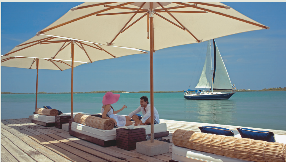
Cartagena Walled City Procolombia