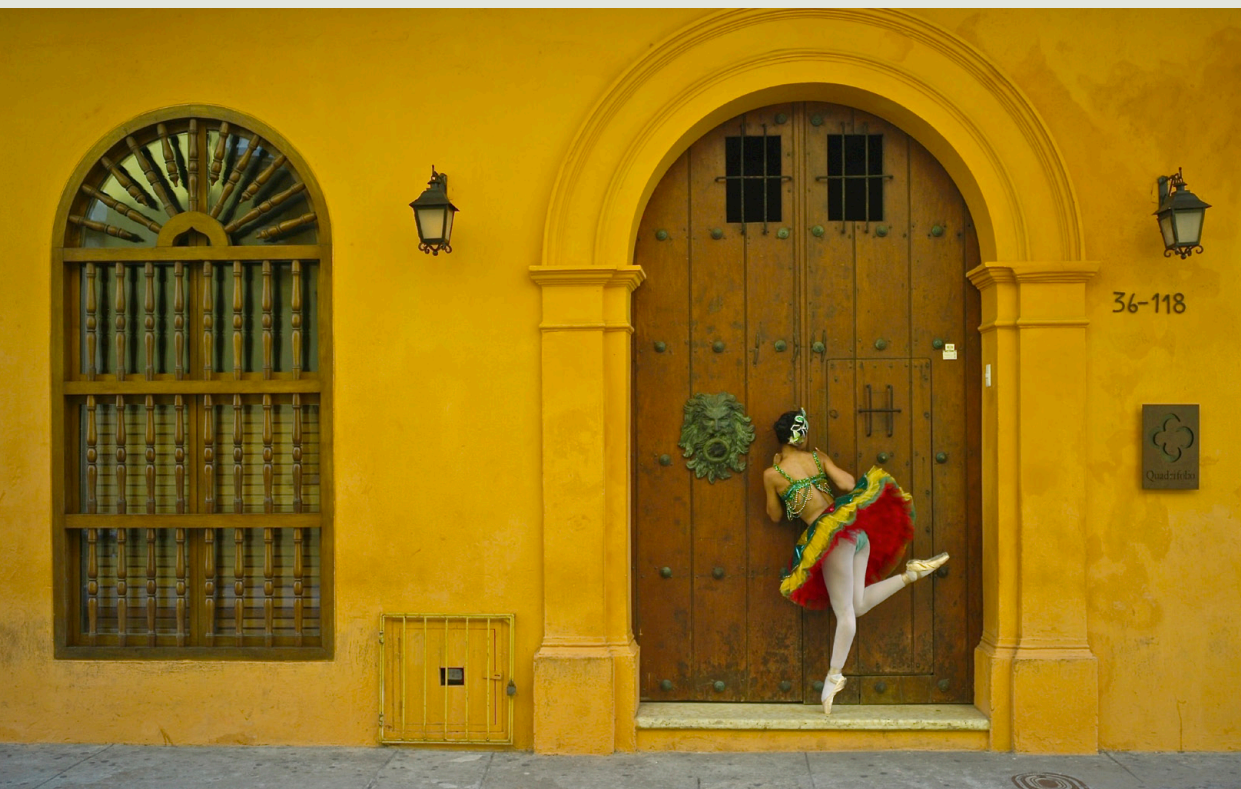
Dancer in Cartagena Kike Calvo