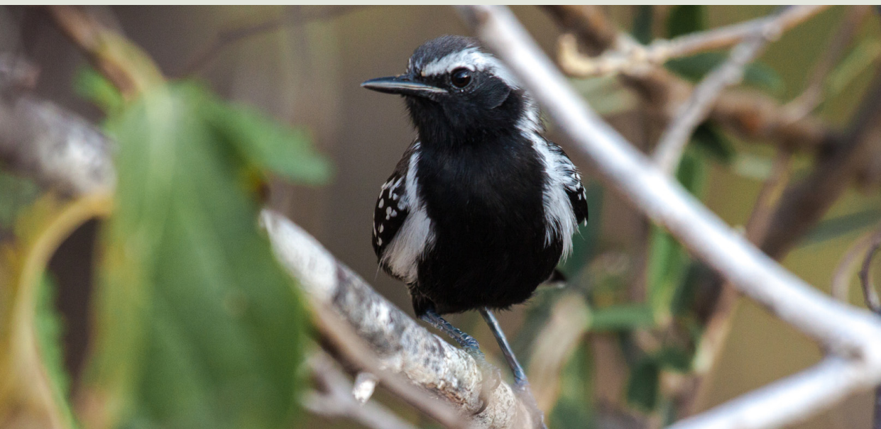
White-fringed Antwren