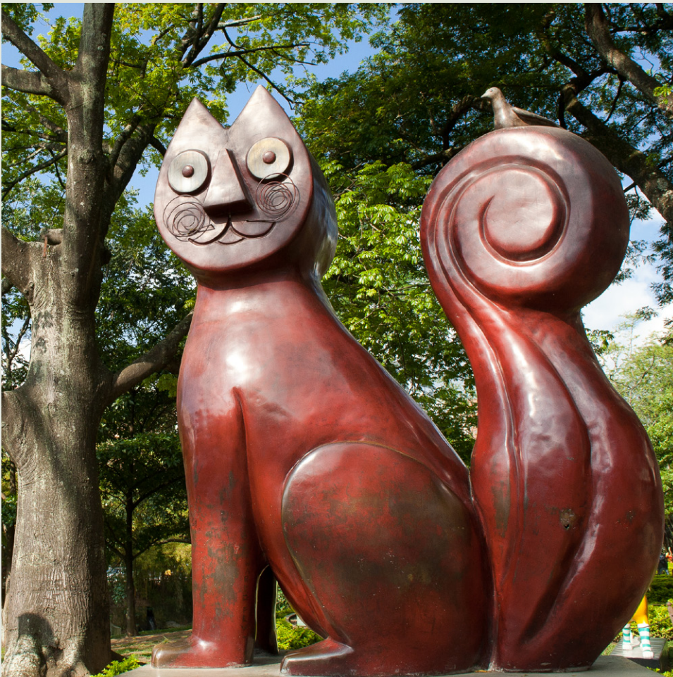
Cat of the River Procolombia

of the morning will be spent visiting the Cristo Rey monument for panoramic views of the city. Lunch will be at the Galeria Alameda , a bustling market where the harvests from nearby farmlands and the Pacific Ocean are displayed.