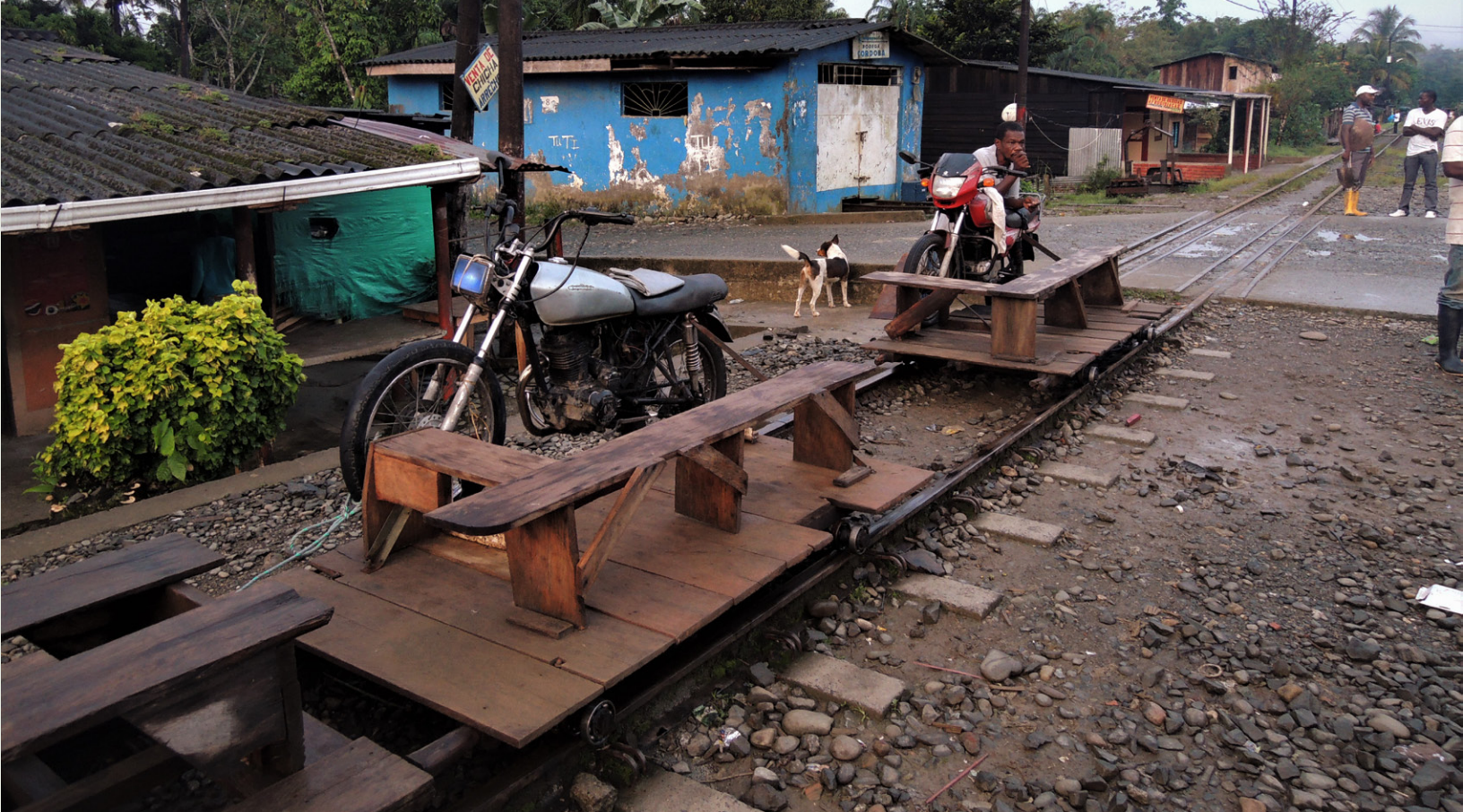
Brujitas in San Cipriano Christopher Calonje

cal women. This iconic regional dish consists of fish, coconut, plantains and manioc cooked into the soup in a specific order and with a calculated amount of local herbs and spices. After lunch, another Brujita ride is followed by a 1 hour drive to the lovely hotel in Buenaventura.