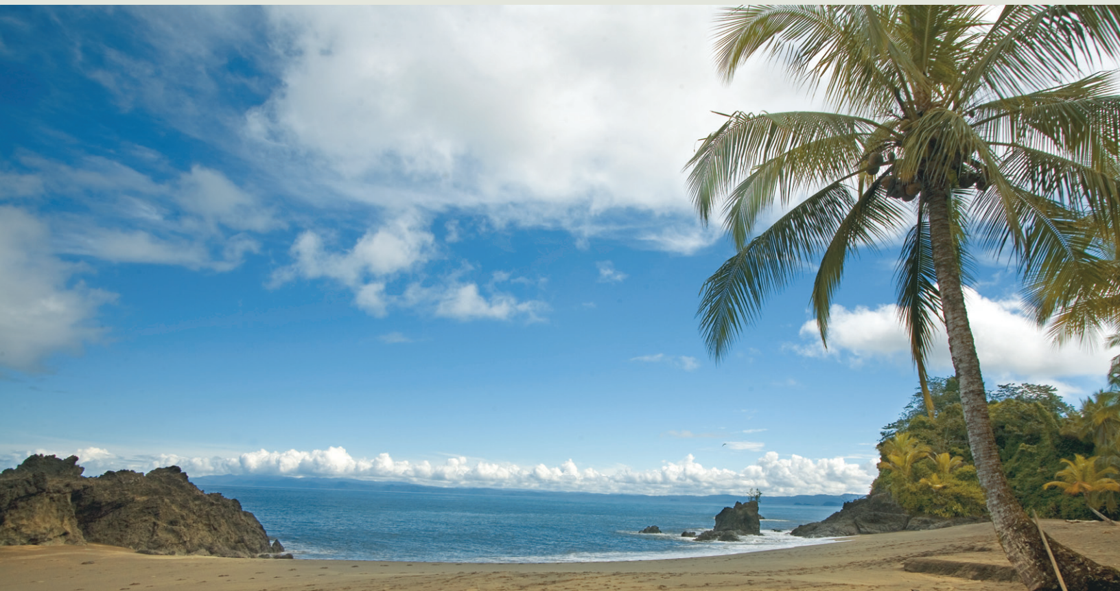
Juan de Dios Beach Procolombia