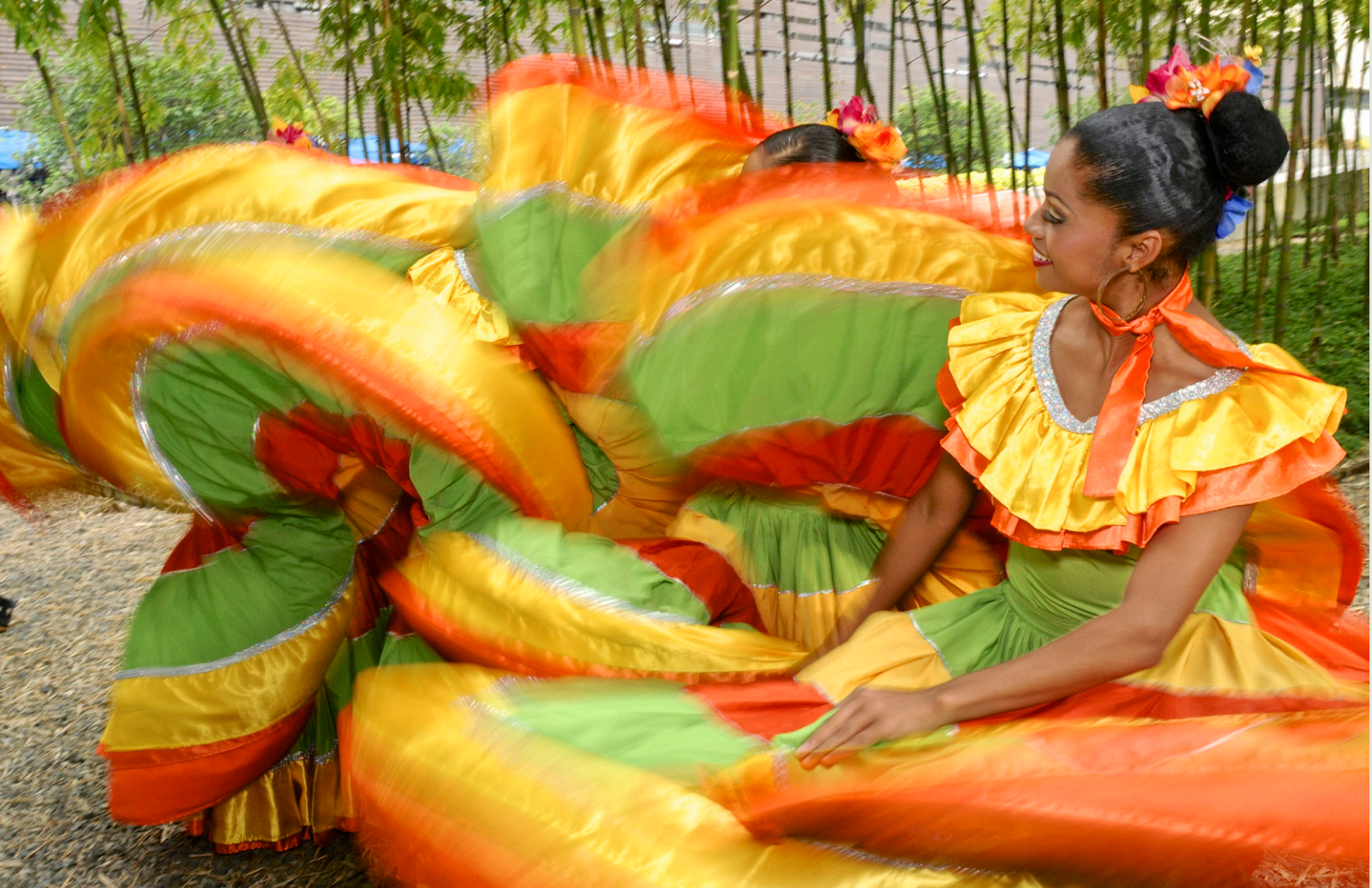
Traditional Dance Kike Kalvo / VWPics

of whales are known for breaching and other distinctive surface behaviors, making them ideal for photographers wanting to capture this majestic being.