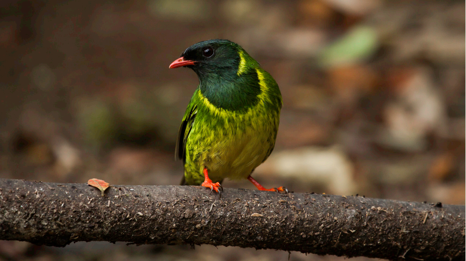
Green and Black Fruiteater Christopher Calonje