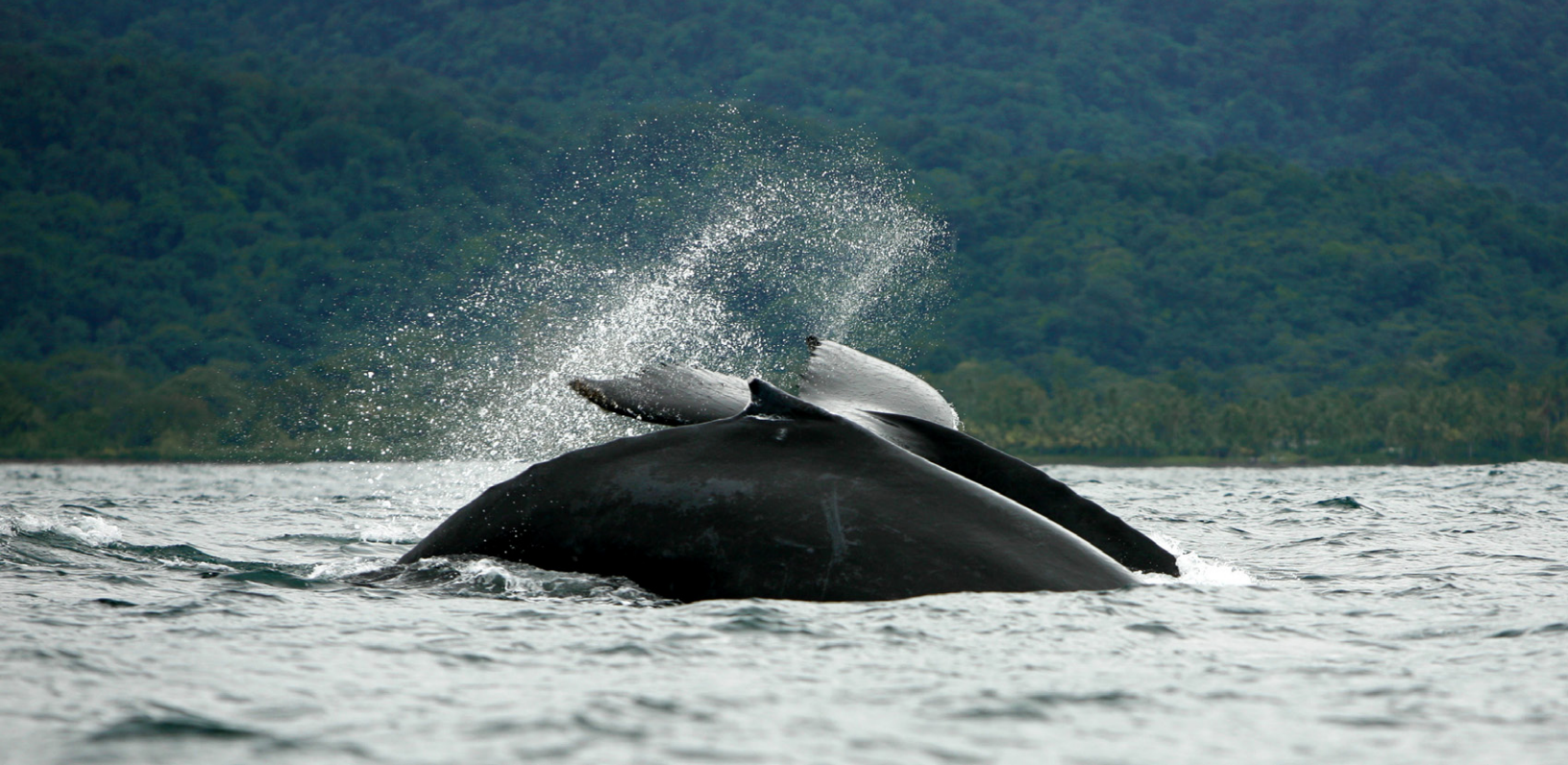
Humpback Whales Procolombia